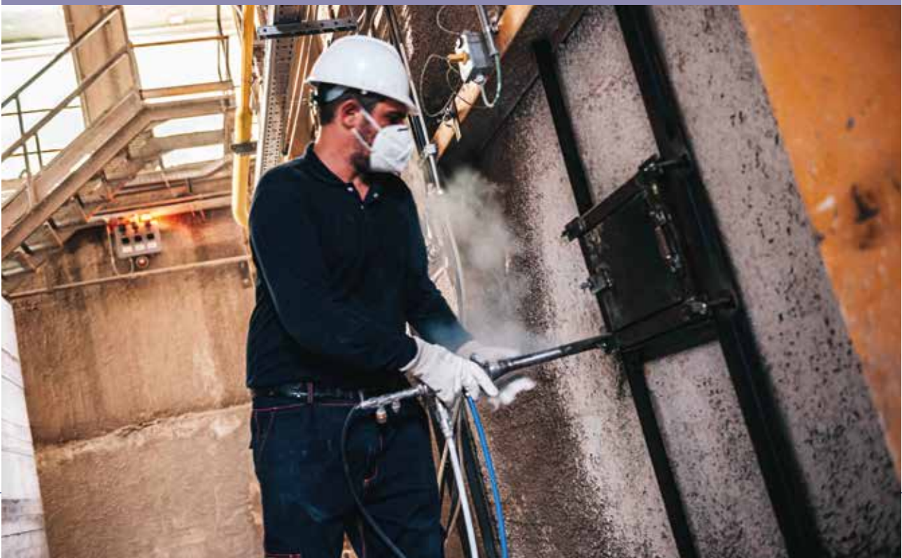
Pic.1 - The installation of Stara Glass SNCR systems is performed while the furnace is running

Field validation supports this design approach. To date, eight SNCR systems have been installed by Stara Glass, demonstrating consistent performance under real operating conditions.