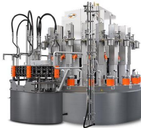
S18 spinning line