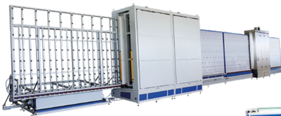
Automatic insulating glass line