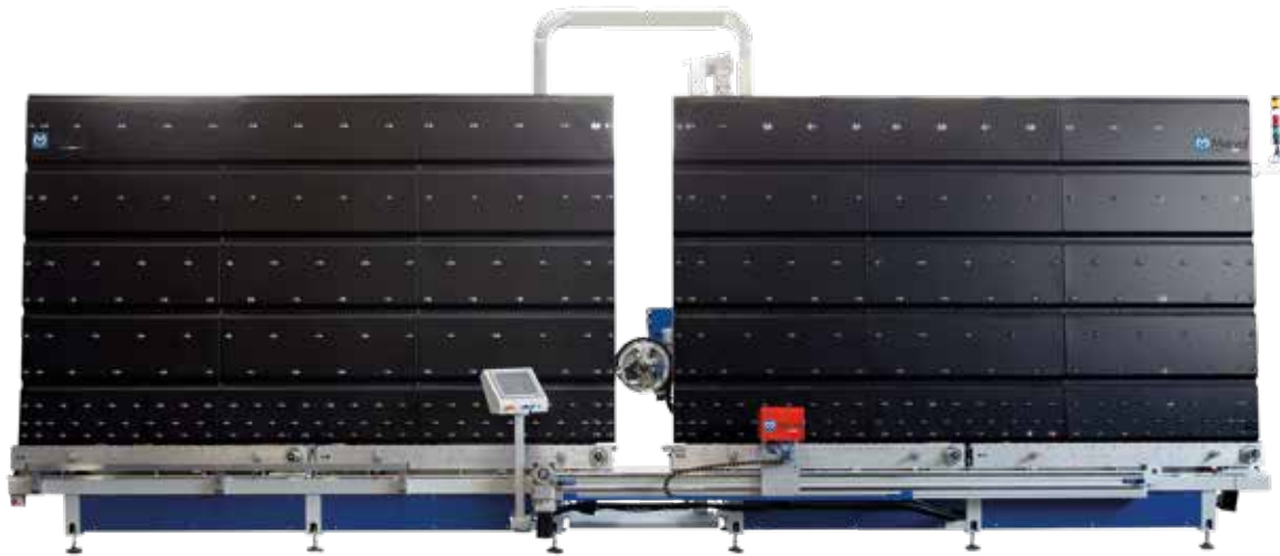
Automatic Sealing Robot