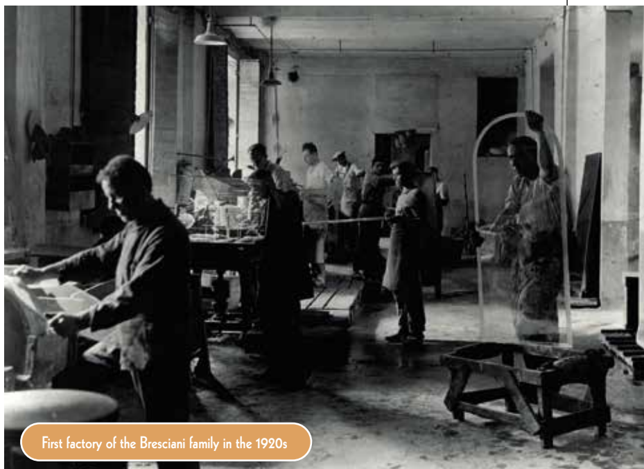
First factory of the Bresciani family in the 1920s