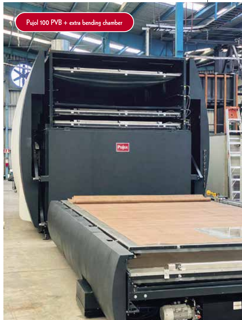
Pujol 100 PVB + extra bending chamber

developed to automatize the manufacture of EVA/PVB laminated glass. Thanks to it, the costs are reduced and the quality of the laminated product is increased by squaring them automatically without the operator making a great effort. The line can also be fully adapted to the characteristics or