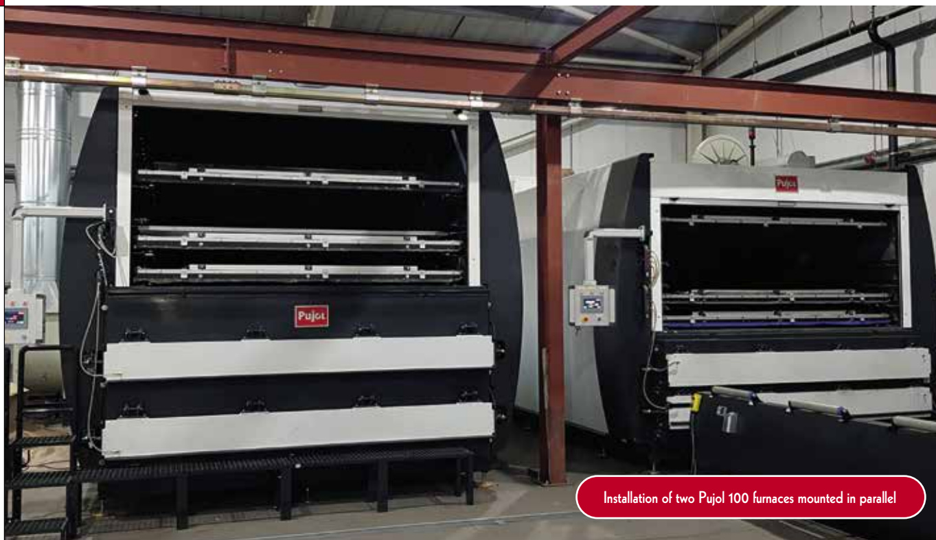
Installation of two Pujol 100 furnaces mounted in parallel

the layout of the workshop through three possible configurations. This versatility makes it easy for any glass processor to install a line of unmatched features.