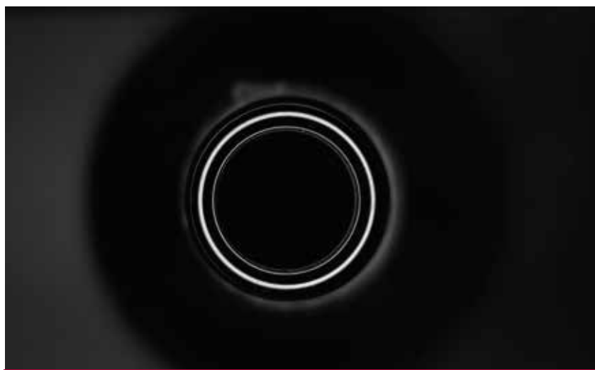
In this image of the sealing surface, the illumination is coming from the sides

These constraints apply to all conventional vision inspection looking for simple features like 'edges', 'bright pixels', 'dark pixels' or 'shapes' – when looking