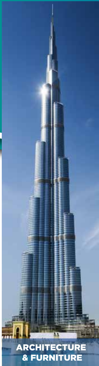
ARCHITECTURE & FURNITURE