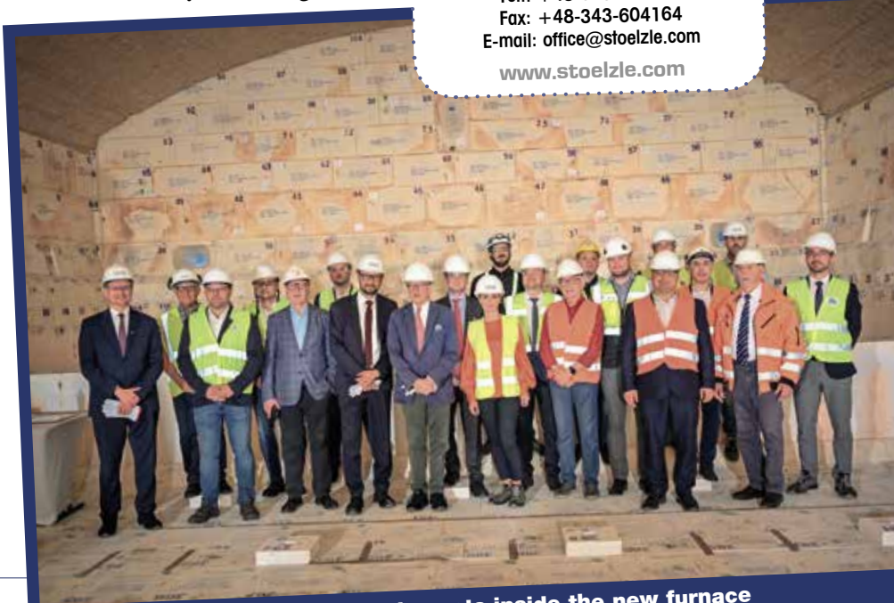
Stoelzle team and guests inside the new furnace

Warszawska 347 PL - 42-209 - Częstochowa - POLAND Tel.: +48-343-604500 Fax: +48-343-604164 E-mail: office@stoelzle.com www.stoelzle.com