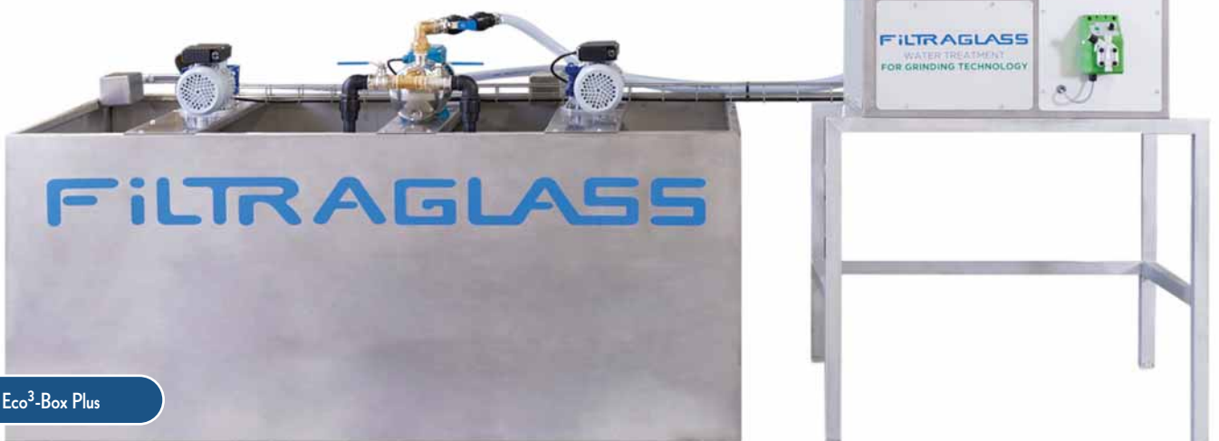
Eco 3 -Box Plus

Filtraglass, experts in water filtration systems for the glass industry, has investments in R&D and ceaseless technological development as part of its DNA ever since the company was founded. The company has continuously worked to improve its systems and adapt them to new market needs and now, more than ever, and it has done so once again. Filtraglass will shortly launch its new mobile app, which is free to use and available on iOS and Android.