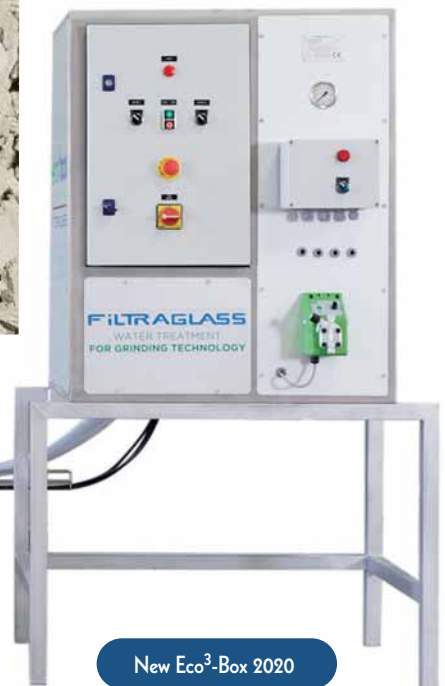
New Eco 3 -Box 2020