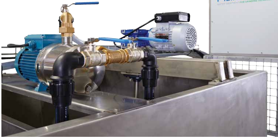
Eco 3 -Box CNC

eco 3 box efficient · ecologic · economica FILTRAGLASS WATER TREATMENT FOR GRINDING TECHNOLOGY