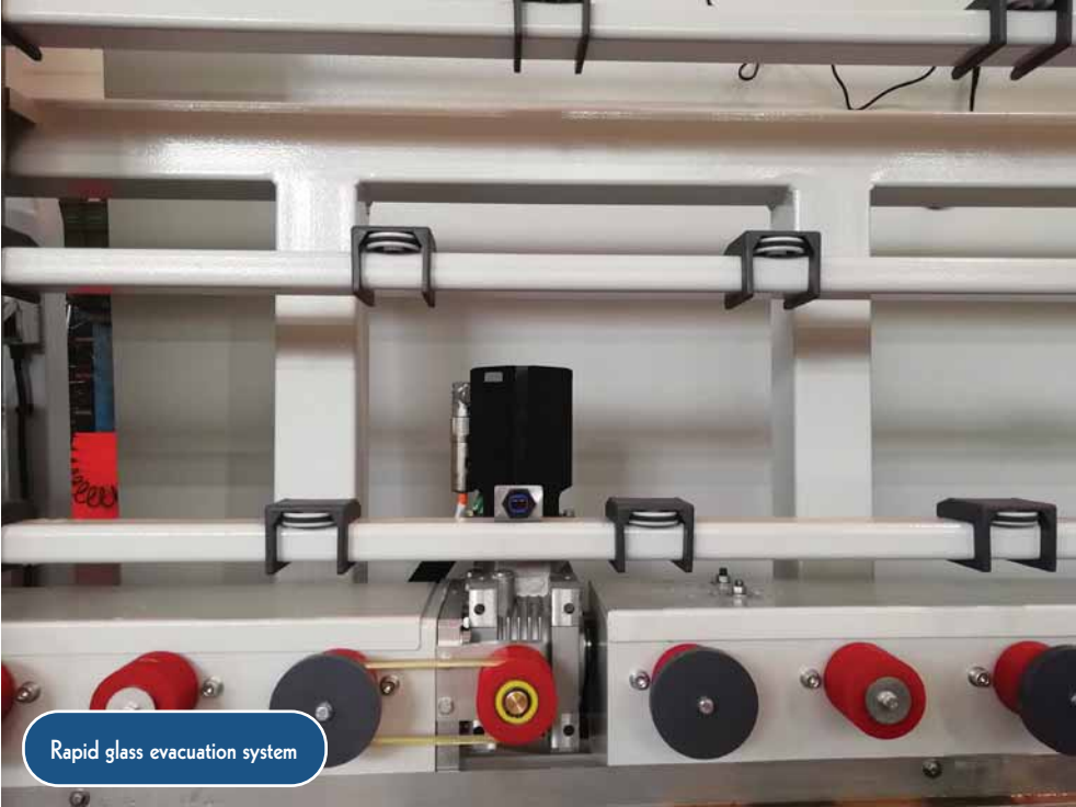
Rapid glass evacuation system

Mechanics and electronics combine to increase the quality, productivity and efficiency of production processes thanks to B Solution's new techno-