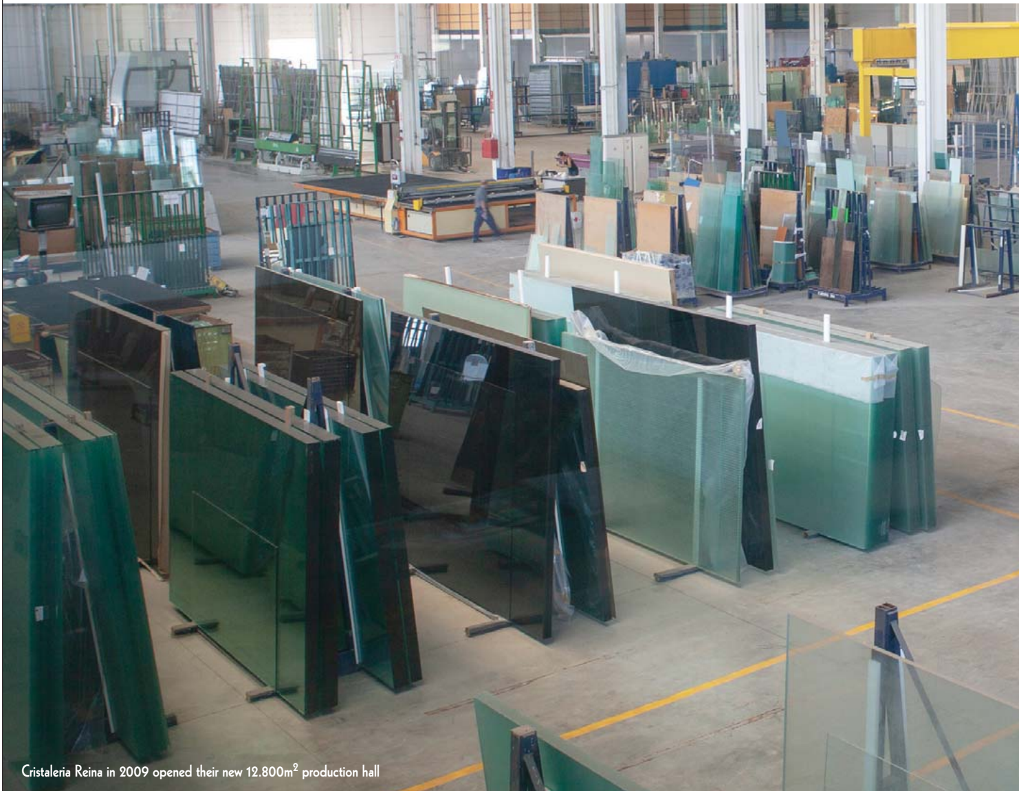
Cristalería Reina in 2009 opened their new 12.800m 2 production hall

cant filling machine. The second investment was an automatic sealing plant. This machine was added to an already existing IG-line of another supplier. Soon, this one was replaced by a LiSEC product, a 3x2-metre IG-line. A bending machine, intelligent warehouse with 100 positions, PKL, two six meters long cutting tables and a 5x3-metre KSR including