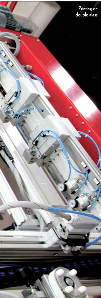
Printing on double glass

through Flexible Engineering, which is the theme that guides the supply of a printing line. In fact, in the technical design phase, every single component of the line is conceived so that it can be customized and configured according to the contract specifications without the need of using excessive resources. The high potential for customization can be seen