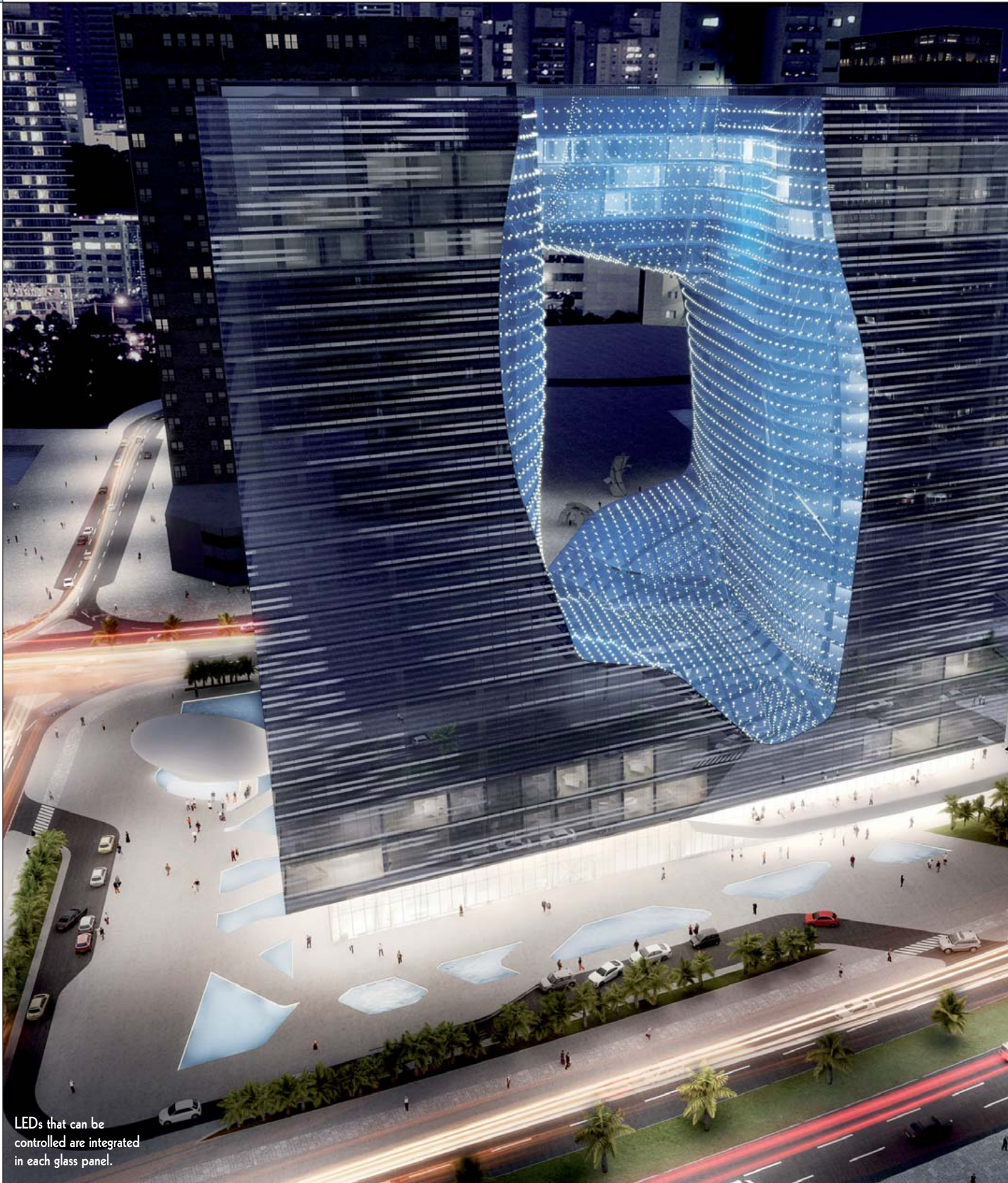
LEDs that can be controlled are integrated in each glass panel.