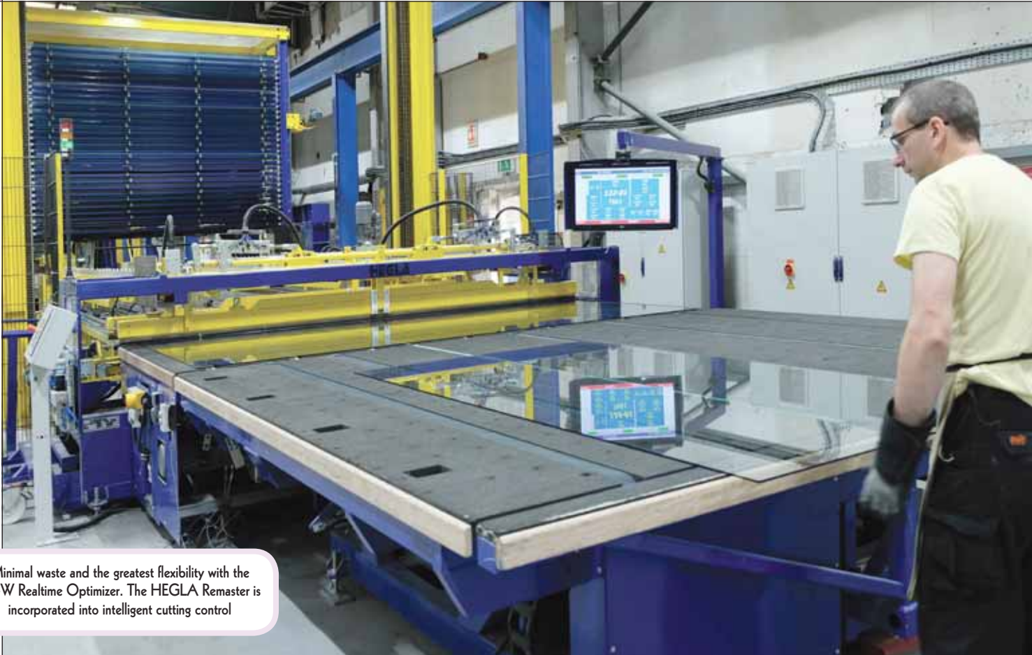
Minimal waste and the greatest flexibility with the A+W Realtime Optimizer. The HEGLA Remaster is incorporated into intelligent cutting control

load data about planarity, roller wave and edge lift from the iLook and it is available in our IT system at all times. Our customers are enthusiastic about this quality management, for it provides them with the greatest security for their projects.”