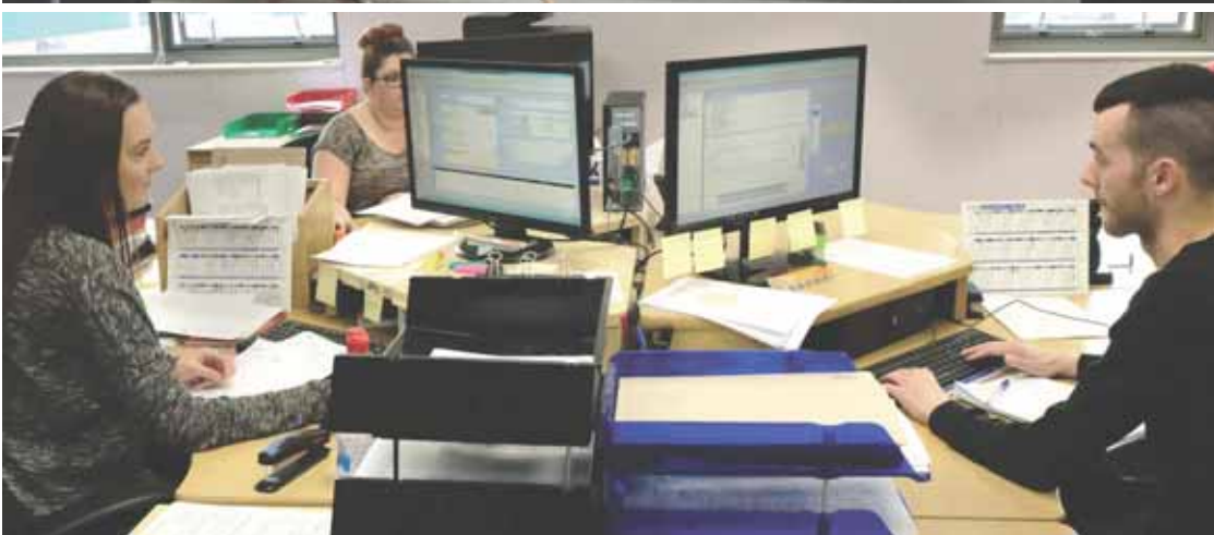
Order entry with A+W Business. The data is available immediately everywhere at the company