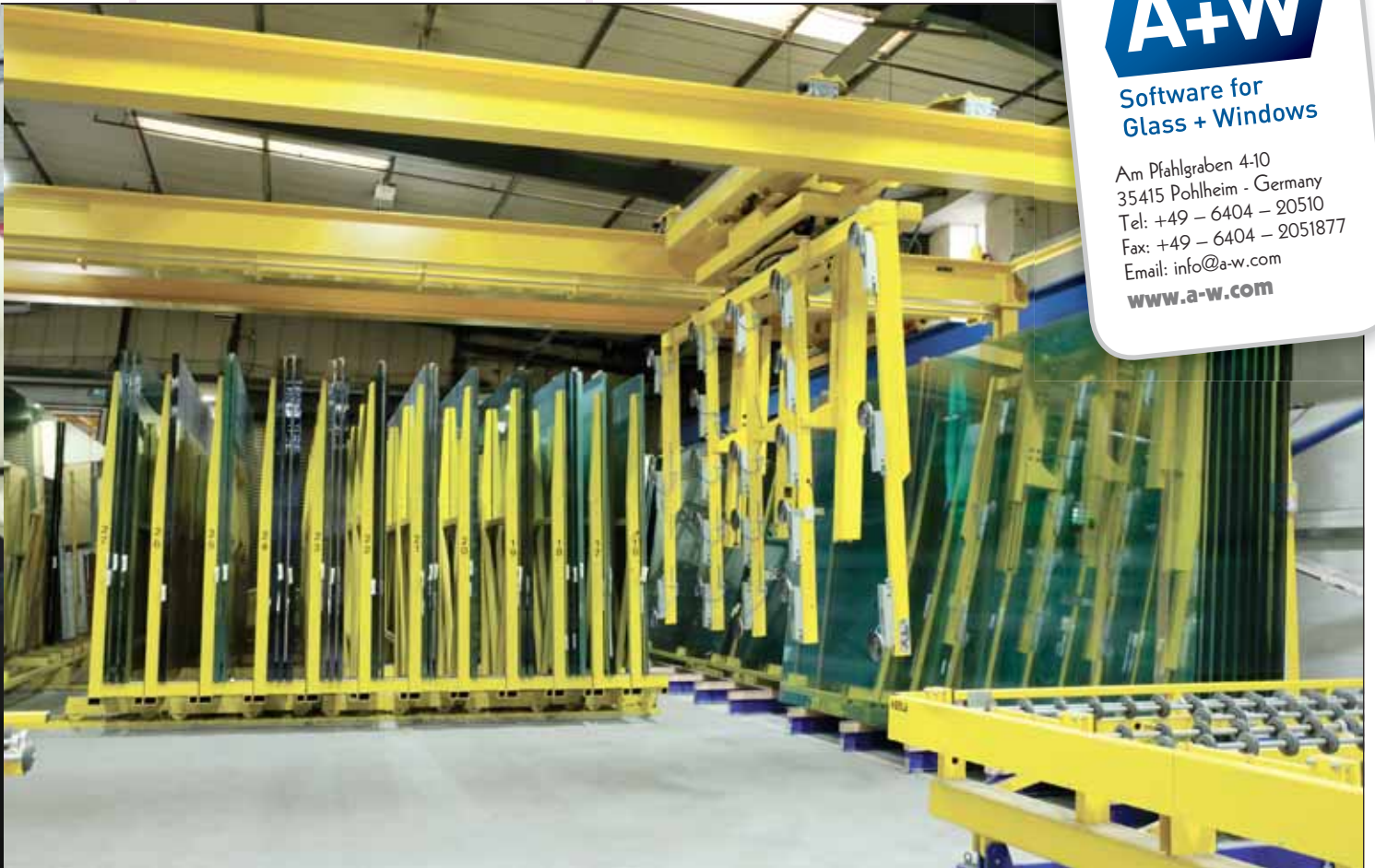
The HEGLA compact storage system with gantry crane ensures fast and continuous supply of the cutting tables

Am Pfahlgraben 4-10 35415 Pohlheim - Germany Tel: +49 - 6404 - 20510 Fax: +49 - 6404 - 2051877 Email: info@a-w.com www.a-w.com