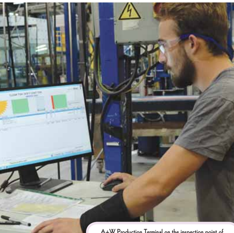
A+W Production Terminal on the inspection point of the insulated glass line: sheet structure, position and correct orientation of the layer are displayed clearly