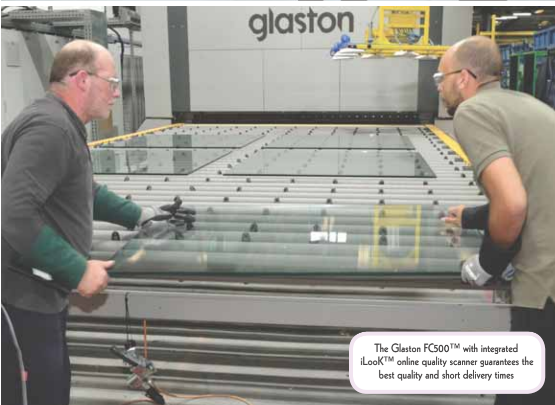
The Glaston FC500™ with integrated iLook™ online quality scanner guarantees the best quality and short delivery times

The focus on jumbo stock dimensions results in advantages with respect to performance and yield. A portal crane feeds the float and LSG cutting tables from an automatic compact storage system. First cuts are held directly in a state-of-the-art Remaster residual sheet storage system and, controlled by the A+W Realtime Optimizer, fed selectively into cutting. This is done completely without manual labour, that is, quickly, cost-effectively and in material-friendly fashion. The residual sheets remain available on the production line and can be processed further rapidly.