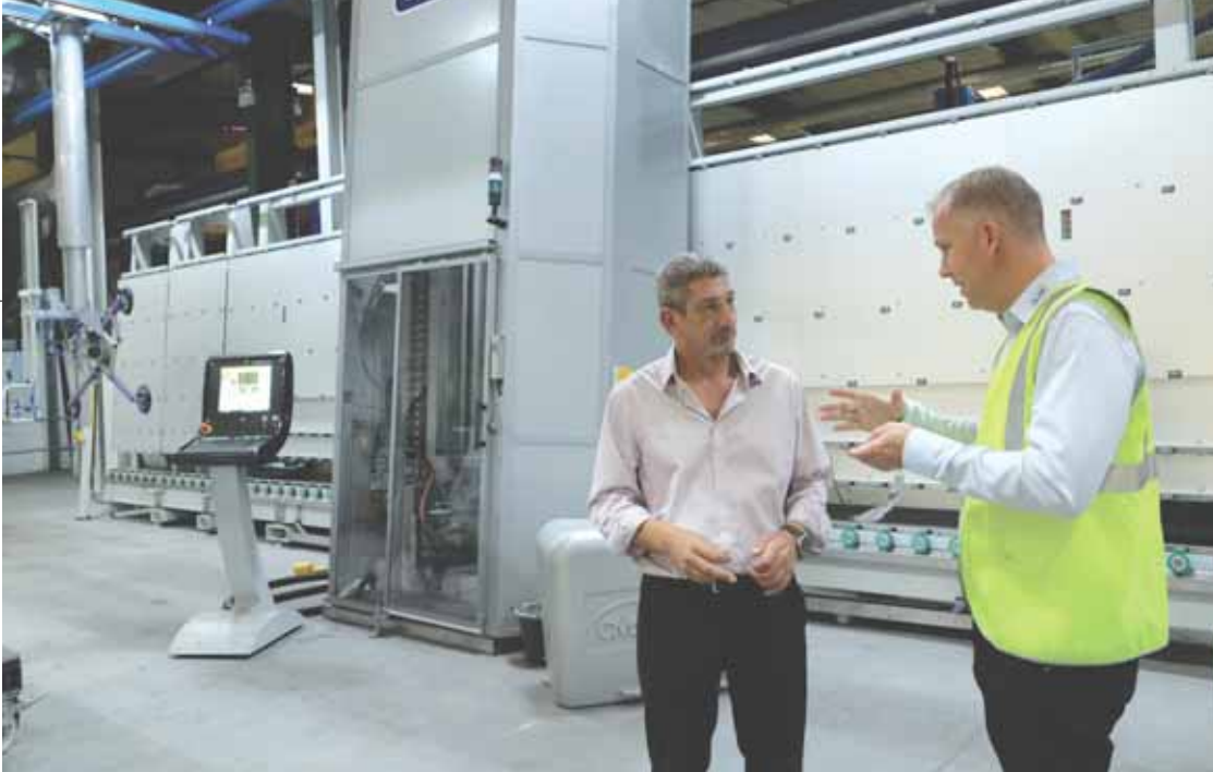
Quick throughput processing with the CMS CNC processing centre

chain production flows, split up large batches and create new batches. Interventions by the machine operator are possible at any time, rush orders and re-makes are integrated without problems.